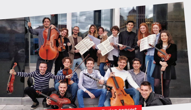
Juvenilia: Fire of Youth – humanitarian concert

The International Cooperation Office of the Academy of Music is a central hub for managing international student and staff mobilities, exchanges, and projects, fostering a diverse and inclusive learning environment for students and staff. Furthermore, the office plays an important role in establishing and maintaining partnerships with international partner institutions. It provides the necessary information and support for students and teaching and non-teaching staff for their international mobility for studying, teaching, and training, through different kinds of programmes (Erasmus+, CEEPUS, SEMP, bilateral exchange) and works to attract and support incoming international students and staff.