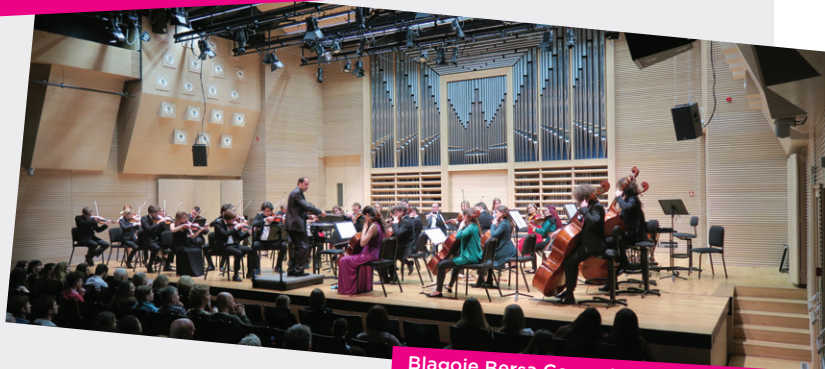
Blagoje Bersa Concert Hall

The academy building is located in one of the most beautiful squares in downtown Zagreb. The heart of the building is the Blagoje Bersa Concert Hall, which quickly became a new cultural centre of Zagreb. The hall offers a diverse programme of concerts and performances that appeal to a wide audience of music lovers. It is equipped with high-quality sound and video technology and a cinema projection system. With its transformable stage and auditorium, orchestra pit, and adjustable acoustics, it is suitable for smaller-scale opera performances, as well as seminars, congresses, and a variety of other events. The Concert Hall is equipped with the specially designed Rieger organ, an instrument of the finest quality and beauty, suitable for teaching, recitals, and performances with orchestras and choirs. Besides the main concert hall, the Academy of Music has three smaller venues that can accommodate up to 100 people, ideal for student recitals, small ensemble rehearsals, and chamber music concerts. The new building has 42 classrooms for individual lessons and chamber music, 9 classrooms for group lessons, and 35 practice rooms. In addition to common areas for students and teachers, the Academy of Music has two flats for visiting teachers and artists.