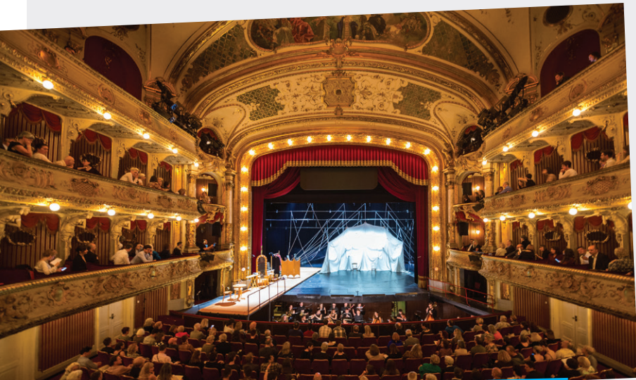
Čoši fan tutte , opera by W. A. Mozart – Croatian National Theatre in Zagreb

Zagreb is the cultural centre of Croatia. The city boasts 15 theatres, a dozen concert halls, and numerous cinemas. Zagreb is also a European hub for modern and alternative culture, undoubtedly the place to be in Croatia. Get a taste of the city's history by visiting the Upper Town or check out one of the many museums and galleries. Lake Jarun, situated south-west of the city centre, is the perfect place for a brisk walk and coffee during the day or clubbing at night. Zagreb and its surroundings offer a great variety of sports and leisure activities to suit all tastes. If you like spending time in nature, try Medvednica Mountain, which extends just above the city. It is a favourite destination for city dweller's excursions, not only because of its protected nature but also because of the several cozy restaurants situated on its slopes.